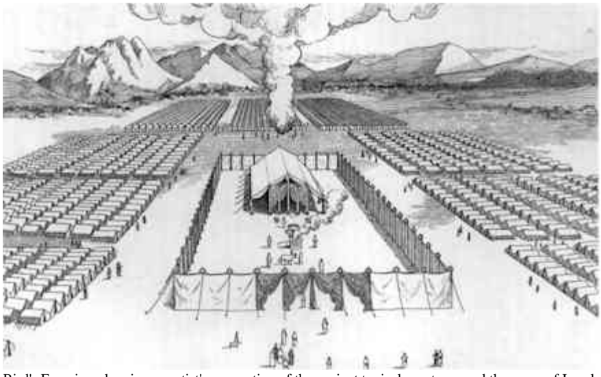
Bird's Eye view showing an artist's conception of the ancient typical sanctuary and the camp of Israel